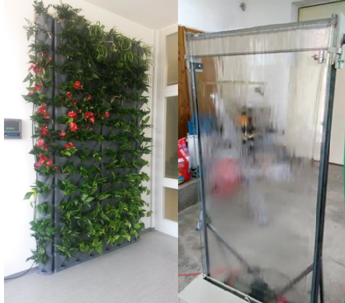
Fig. 3. Models of green walls and water wall prepared for experimental study