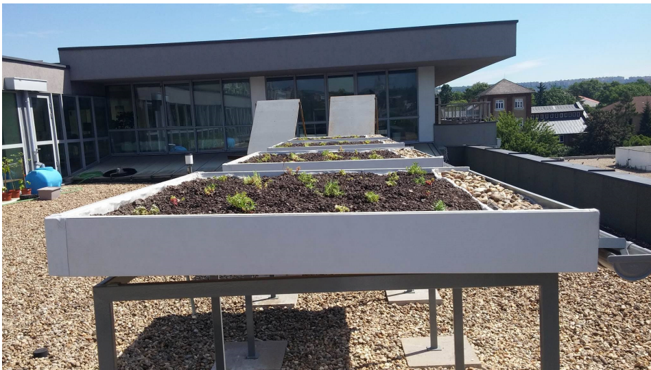
Fig. 2. Models of green roofs prepared for experimental study

For this reason our aim is to explore the green design that is blending of four co-operating infrastructure strands into a seamless system. In this paper we introduce our experimental platforms representing different types of green roofs and green/ water walls. These experimental sites in the University Campus were created on the basis of different research in the frame of doctoral thesis as well as grant project dealing with green roofs and their retention qualities, as well as green or water walls and their impact on the microclimate and the possibility of using rain and gray water that could be filtrated through the media of these structures. (see Fig. 2 and 3).